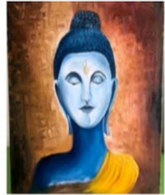
Lavina Jain (Batch '22)