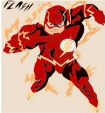
Shamit Trivedi (Batch '22)